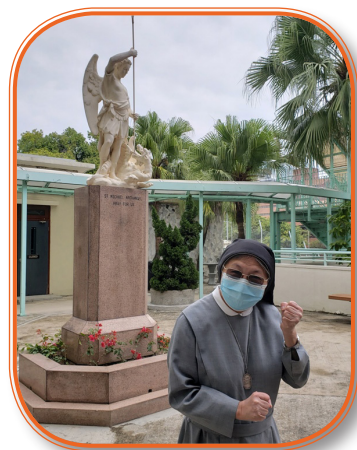
Striking a pose at her favourite spot!