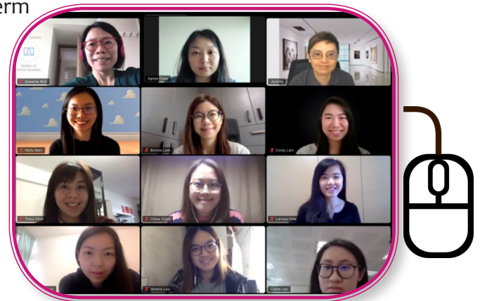
Mentors during online briefing meeting prior to seeing their mentees in breakout rooms.

Throughout the year, mentors and mentees will meet a couple of times online. Based on the interests of the mentees, mentors will guide them and help them to discover themselves and their aspirations. The new virtual format will allow more flexibility for mentor-mentee interaction, and we