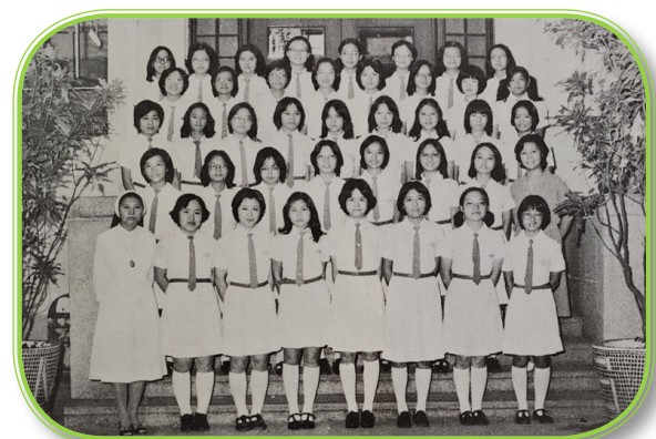
With her students in a class photo.