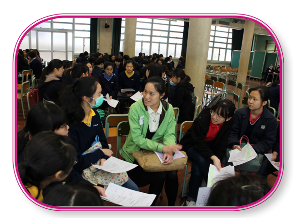
A mentor sharing advice with her mentees about work and life.

The kick-off meeting for the Tier 1 programme was held on 10 November 2018 which was the first time the mentors and mentees met to acquaint with each