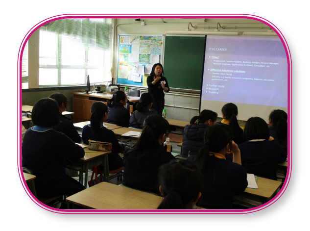
Career seminars provided opportunity for mentees to learn about a job from a practitioner.

other. Groups were formed based on career interests, enabling natural exchange of ideas. We