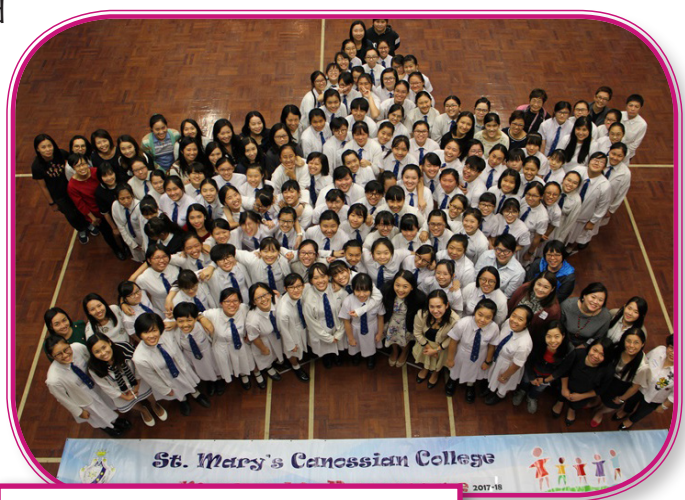
A starry greeting from mentors and mentees!

Thanks to the generous support of past St. Marians, the Mentorship Programme of the 2017-18 academic year was completed in March this year. 42 alumnae participated as mentors to care for 120 student mentees for Form 5. They met during the kick-off ceremony on 4 November 2017 during which matched teams were introduced to each other and given the opportunity to plan for further meetings in the year ahead. A second gathering was held on 24 March 2018 where 15 mentors hosted careers seminar sessions to share their knowledge in various professional fields. Student mentees attentively participated and were inspired by the precious sharing from their seniors.