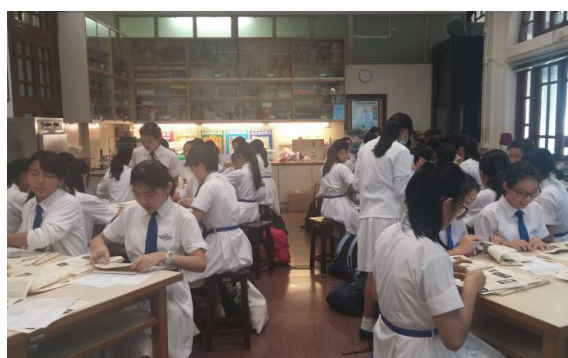
Students helping with lettershop work of our newsletter.

Throughout the years, our younger sisters at school have been helping us to handle the lettershop work