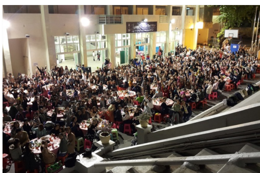
...and join a feast in the evening!