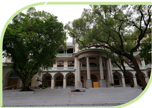
The old tree in the middle was removed – resulting in a clearer view of the pillars behind!

While we shall always miss the tree that had accompanied generations of St. Marians for so many decades, we are also relieved to know that staff and students can be safe on the steps and the playground. The school will continue to monitor and upkeep other trees on campus, ensuring the safety of both plants and people.