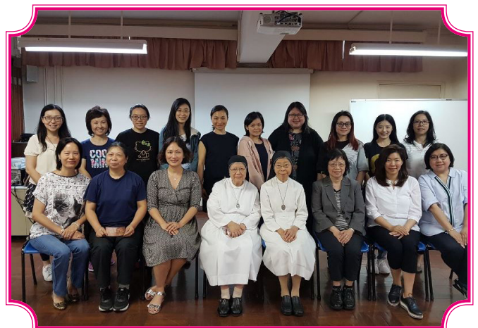
Participants at the “Mother Mary as our Mom and Role Model” Retreat.

Mary, in a very splendid way, did this flawlessly and we are blessed to learn from her, how we can do this best in the real world. When we were asked to take up significant challenges in life, our reaction was probably similar to Mary’s: “How can this be?” Like Mary, we may not consider ourselves worthy of such a calling. This modesty is completely understandable. However,