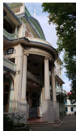
Come visit your Alma Mater in the afternoon....

The campus will be open from 3:00-5:00pm on the day. Walk around the School to appreciate the ambience of her historical architecture, revisit golden memories and take pictures, exchange anecdotes, while learning about new progress and development. Student Council members will be standing by and ready to exchange stories with you. This is the perfect opportunity to bring your family to experience the beauty of our Alma Mater!