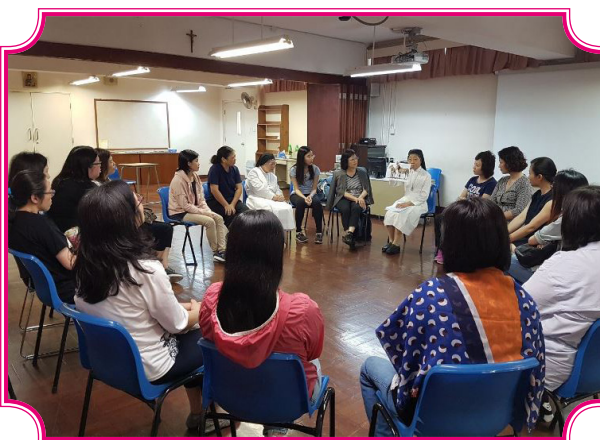
A sharing session during the retreat.

God does not call the qualified but qualifies the called. We can continually endeavour to say “Yes” to God’s call. And we do so with the humility that Mary showed: “I am the handmaid of the Lord. Let it be to me according to your word.” (Luke 1:38)