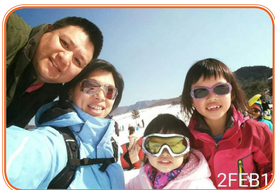
A happy family skiing trip with husband and two daughters.