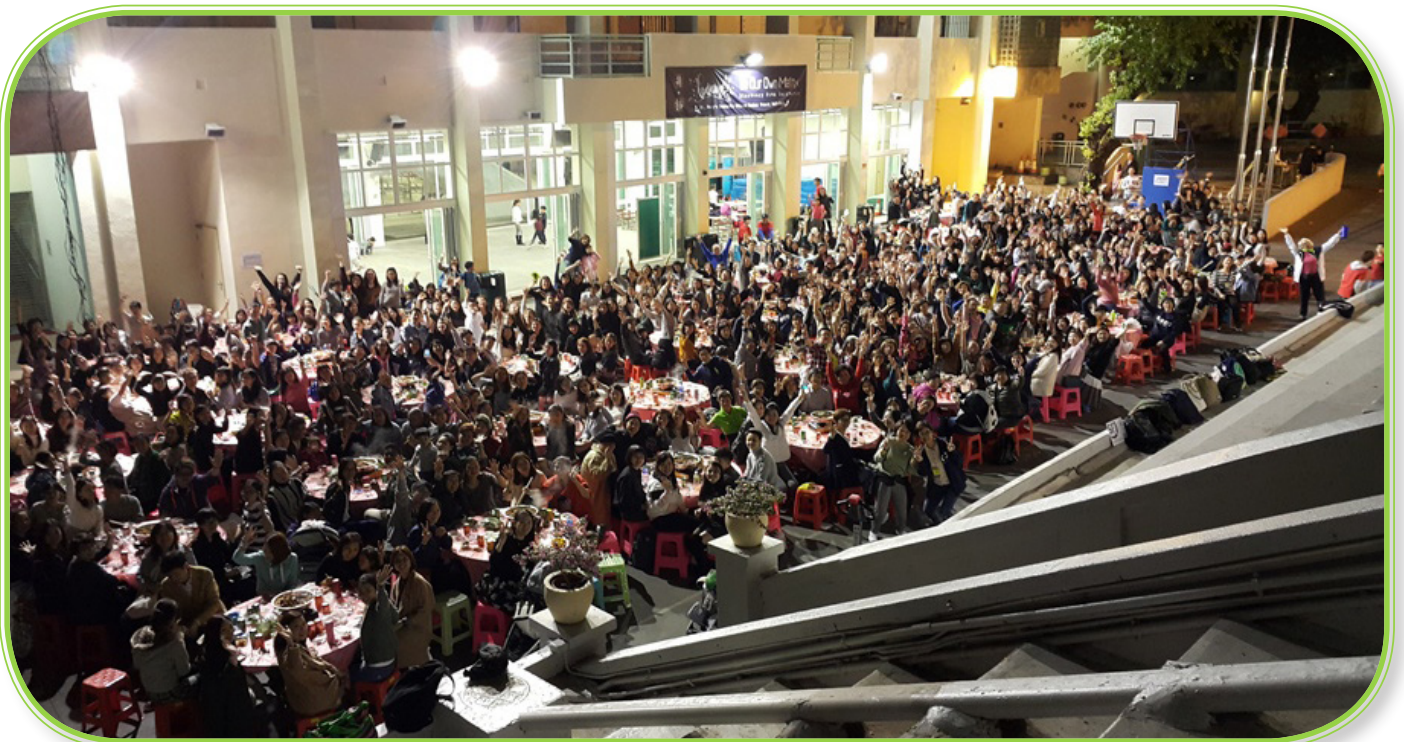
Over 600 happy faces gathered around 50 tables to enjoy the delicious meal.