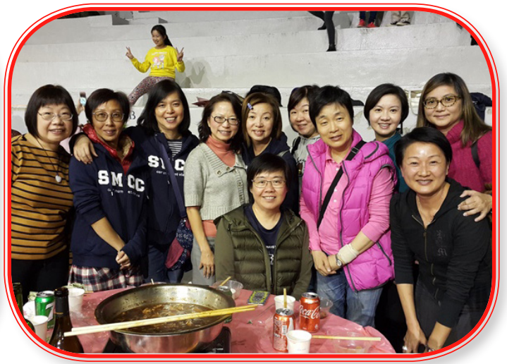
Friends were delighted to see each other, especially over a full stomach!