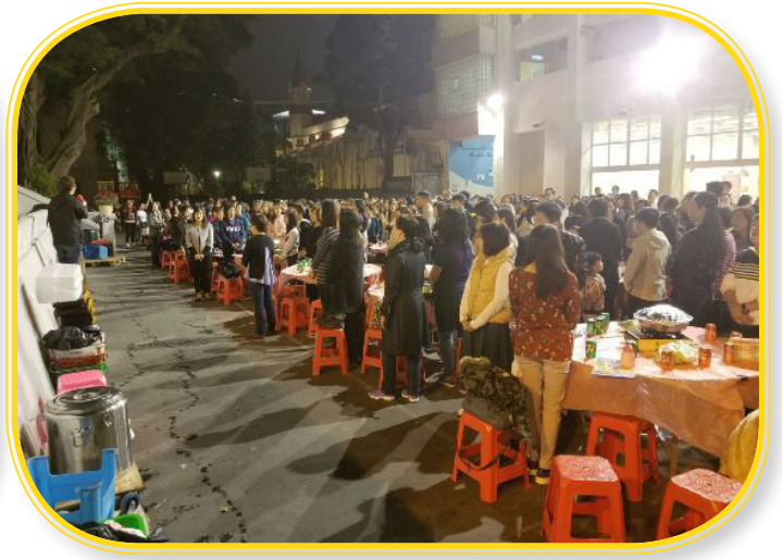
All singing the school song before dinner started.