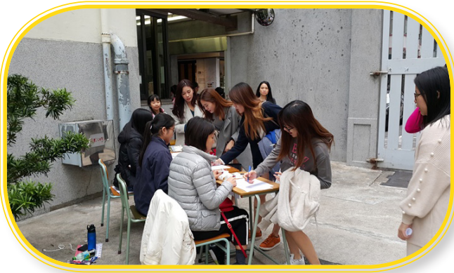
Visitors at the reception counter during Alumnae Day.