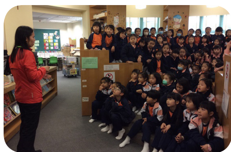
P.1 pupils attentively enjoying a story-telling moment by a volunteer parent.

Many people have noticed that the young generation nowadays does not do much reading. However, good reading skill is essential for life-long learning. Hence we strive to train our pupils to be enthusiastic and smart learners, as well as develop a self-directed learning attitude through good reading habits. They are taught to read often, and to make friends with books. Every year our librarian organizes various activities to add fun to reading, and pupils are encouraged to read different types of books, not only those that they are interested in or familiar with. They are assigned reading tasks by their English and Chinese teachers, as well as their Social Studies, Music, Science, P.E., R.E., Geography, and Visual Art teachers. For upper classes, pupils are given a recommended booklist for reading.