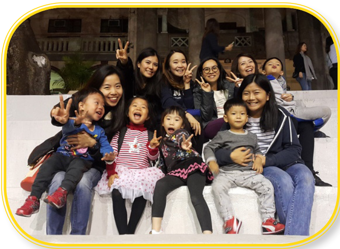
Mothers were having as much fun as their young ones.