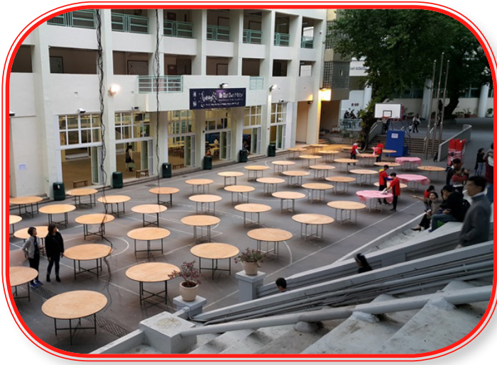
Tables being set in the basketball court in the afternoon.