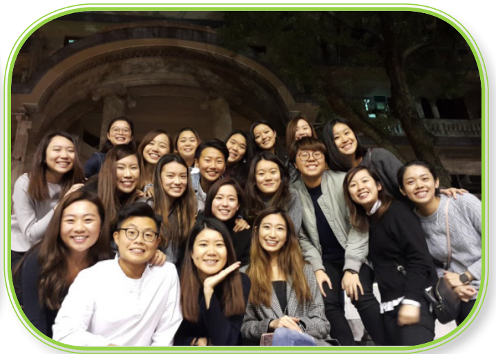
See you again next time!

The evening would not have been successful without the full support of the school management and teachers-in-charge, and the energetic team of student helpers. A big thanks to them on behalf of all alumnae. Special thanks also to the school janitors who tirelessly assisted us during the day. Most important of all, we thank you, our past students, for your continuous support and keen participation. May God continue to bestow his blessings on the St. Mary's family!