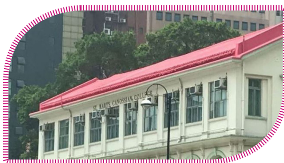
After repairs – nice and clean!