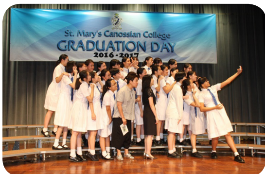
Ms. Wong and F.6 students posing for a casual shot at the Graduation Ceremony.

I am delighted to share with you the good news that this first batch of Through-train students has achieved satisfactory results in the public examination. Their overall performance is on par with their predecessors, and more than ninety per cent of them received offers to undergraduate programmes in JUPAS. The fact that the efforts of our three schools and our students have paid off is worth celebrating. The results are a tremendous boost to us, and showed that we were on the right path in helping our students to discover their talents and develop them to their full capacity.