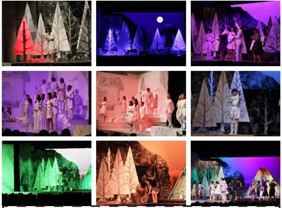
The colour changes with the mood of the latest school play "COLOURS".

Stage lighting, extensively used to create the desired theatre effects, has been an indispensable component in St. Mary's highly acclaimed drama productions. In 2016, with a generous sum of donations, our Alma Mater was able to refurbish our stage lighting system including all lighting fixtures, control panel, signal wires and light bars.