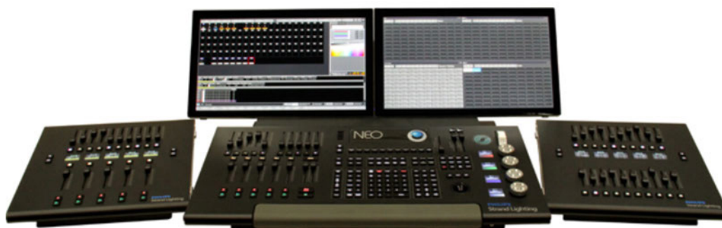
Left : Altman cyclorama light, Philips Selecon Fresnel. Right : Philips Showline Parcan (Visible & UV). Centre : LED lighting panel.