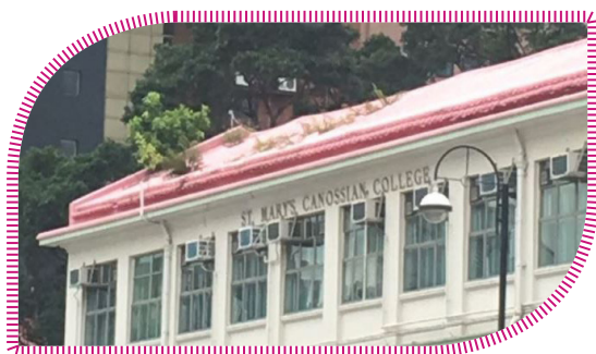
Before repairs – plants were growing atop!

Since March this year, alumnae who passed by our school along Chatham Road would notice scaffoldings surrounding the St. Michael Building (a.k.a. the Old Building). The tiled rooftop of this Grade 1 historic building had been in poor condition with plants growing out of the cracks, and water leaking into the classrooms. Thanks to the assistance from the Education Bureau and the Antique and Monument Office, major repairs were carried out during these past months, just in time for the new school year. Now the rooftop has been fixed and further freshened up with a layer of new paint, echoing the architecture of Rosary Church nearby. St. Marians young and old can continue to take pride in our Alma Mater which not only preserves a piece of Canossian history, but also that of the territory. Live St. Mary's ever more!