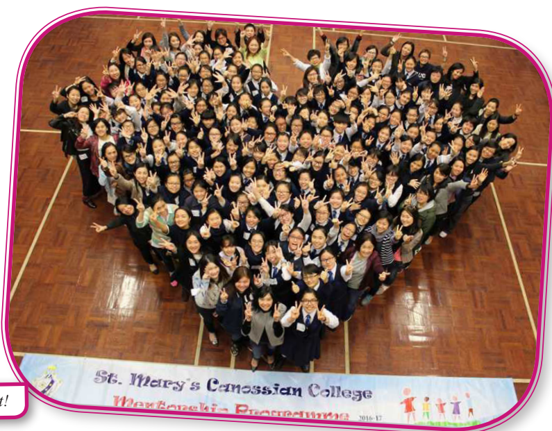
Mentors and mentees sharing a joyful and hearty moment!