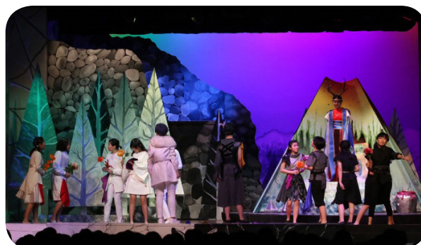
The stage effect of the play "COLOURS" was enhanced by the new lighting system.