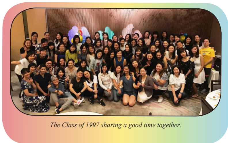
The Class of 1997 sharing a good time together.

The Class of 1997 celebrated their 20th Anniversary Reunion over a boisterous Chinese dinner on 8 July 2017 . Over 60 alumnae caught up with each other again after their big reunion party at the school's tuck shop 10 years ago! To reconnect with the group, please contact Juliana Wong at keroppijuli@gmail.com .