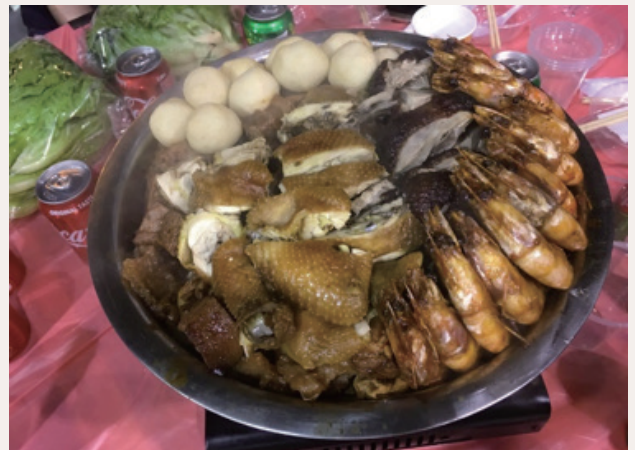
Steaming Poon Choi...who can resist?