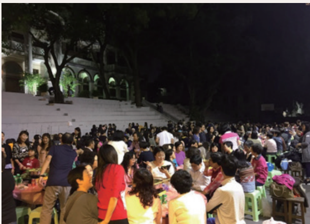
A wonderful dining ambience for St. Marians.