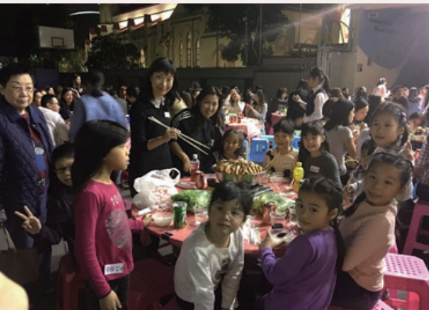
Young guests were equally happy and excited.