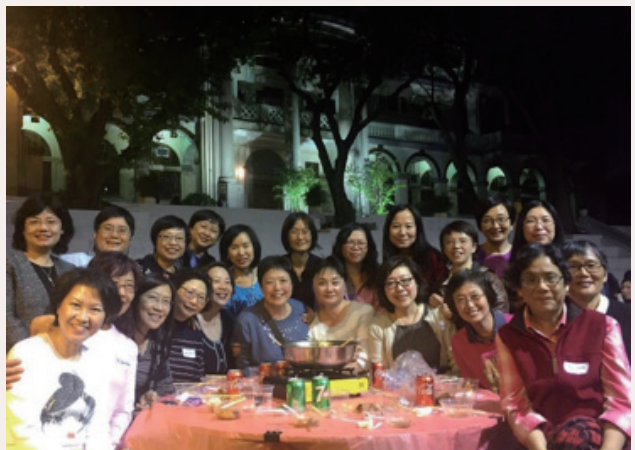
Memorable gathering of classmates and friends.