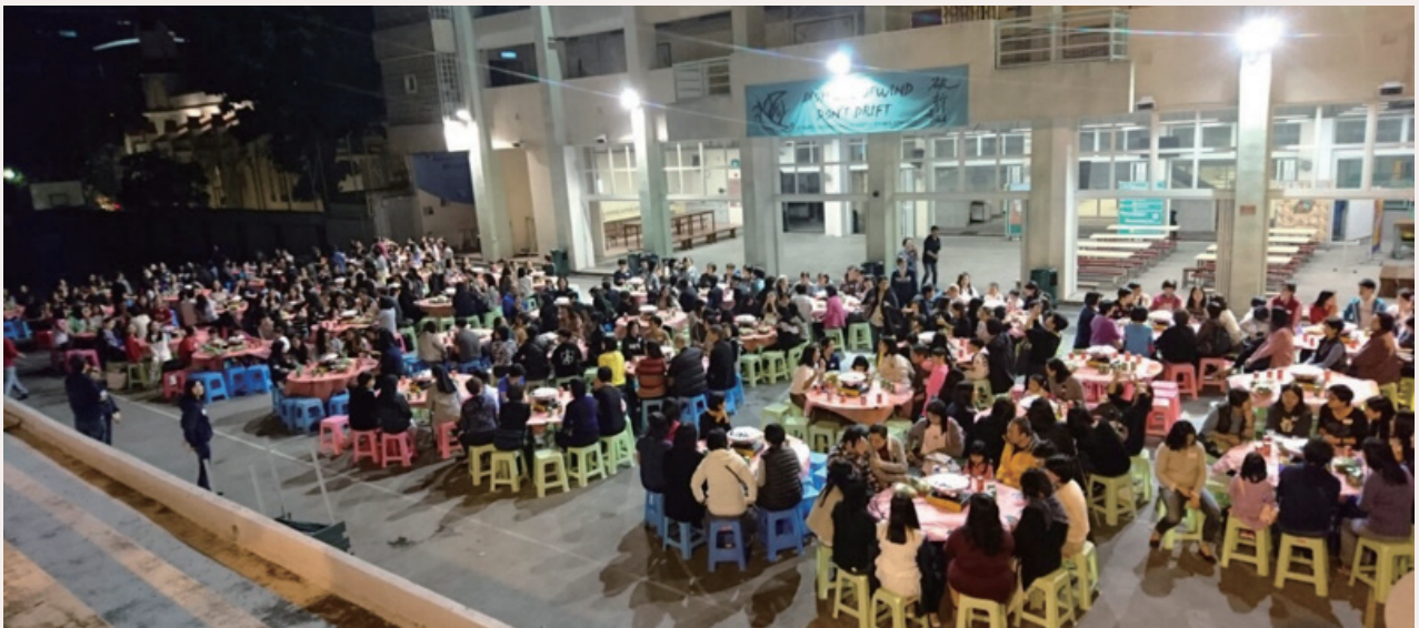
Over 500 participants sat around forty five tables to enjoy the evening. The Chairperson, in front of the big steps, addressed the group before dinner started.

their great hospitality. Special thanks to the school janitors who tirelessly helped us during the day. Last but not least, our sincere thanks to all past students for their support, participation and donation, making the Alumnae Day another unforgettable experience!