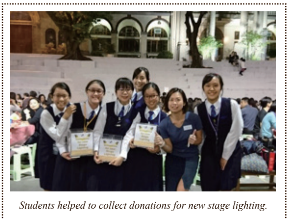
Students helped to collect donations for new stage lighting.

school and secondary school days. As dusk approached, more past students came back to join the Alumnae Day Poon Choi dinner. With the help of God, we had good weather on the day, thus were able to set all 45 tables in the basketball court. Adults and children all shared a wonderful evening together under the stars over delicious traditional Poon Choi. We even invited the Sisters from the convent upstairs to join and share our fun!