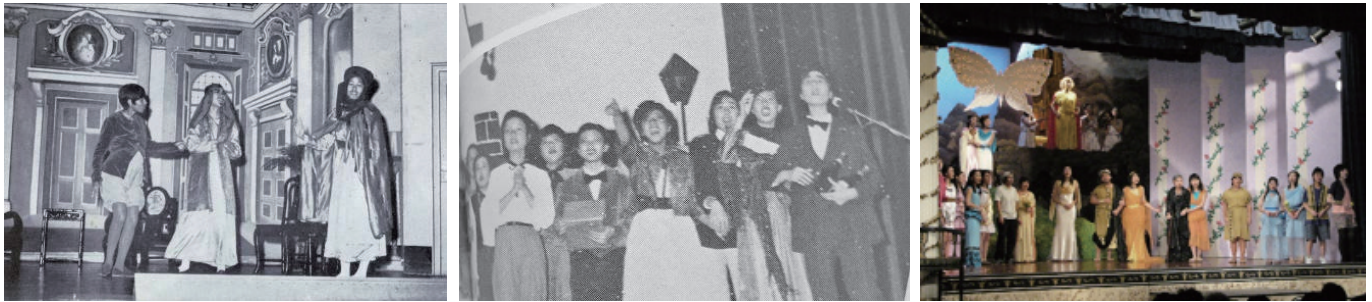
Drama snapshots from the 1960s (left), 1980s (middle) and 2000s (right). Do you recall the performances?