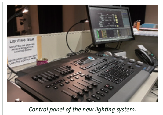
Control panel of the new lighting system.