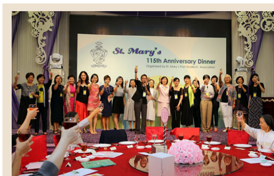
Cheers! Happy birthday to our Alma Mater!

were most delighted to meet many retired and current long-service sisters, teachers and staff of SMCC and SMCS, as well as graduates of all generations, some coming with their daughters or granddaughters who are all St. Marians! Amidst the delicious food served, participants busily engaged themselves in catching up with one another, and taking group photos or selfies – the time was never enough!