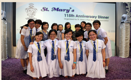
To our enthusiastic student helpers, a big THANK YOU!

We would like to sincerely thank the numerous hands and brains who contributed to make the celebration a success - teachers, school staff, student helpers, prize sponsors, volunteers, exco members etc. We also thank our guests for their active participation, making the event another fruitful evening of joy. May the Canossian spirit live on, and God bless St. Mary's!