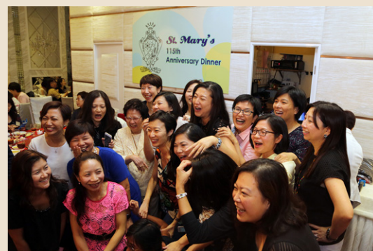
Laughter filled the evening in every corner.