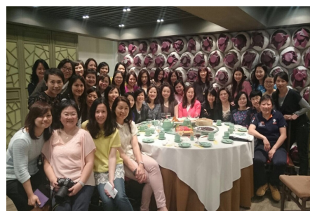
The Class of 1985 at their reunion dinner.