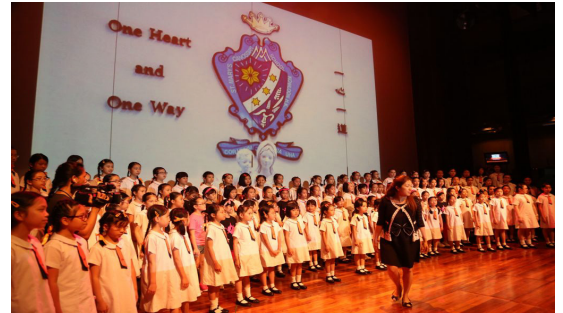
Performance from the school choir.

On 23 June 2015, St. Mary's Canossian School held a Variety Show at the Academic Community Hall at Hong Kong Baptist University to celebrate the 115th anniversary of the school. The celebration provided an opportunity to showcase the diversity in our students' talents and achievements. The opening songs performed by the choir members brought exuberance to the audience, followed by some wonderful instrumental performance and orchestral music which enriched the show with jubilation.