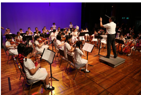
Young St. Marians playing in the orchestra.