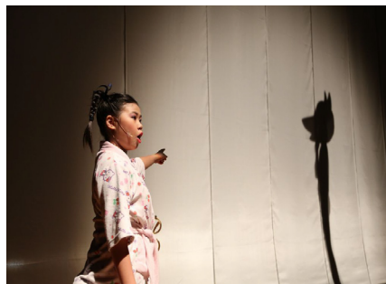
While the shadow puppetry show was seen on front stage...