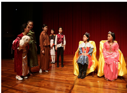
English drama "Princess Impossible".

We are pleased to realise that not only are the teachers of St. Mary's Canossian School committed to sustaining students' academic results, they are also nurturing their versatility with unyielding determination, providing our younger sisters with all kinds of "nutrients" to become charismatic all-rounders. A big thank you to all the teachers, and congratulations again to everyone for such a meaningful and entertaining evening!