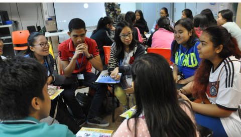
Participants engaged in cross-cultural discussions.

The Canossian Global Youth Conference 2015 (CGYC 15) was successfully held during 20-24 July this year. Jointly organised by a team of St. Marians and Sacred Heartists who are interested in humanity and international relations, it is a leadership training programme featuring cultural exchanges, experiential learning and presentations, while fostering the Canossian spirit of charity and humility.