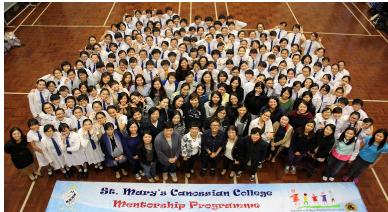
Mentors and mentees in the 2014-15 programme.

The Mentorship Programme entered its eleventh year in the past academic year. The programme has been a means for past St. Marians to share their life experience and professional knowledge with students who are in their second last year of secondary school life. Through this sharing, we help our younger sisters to better prepare for their further studies and career choices.