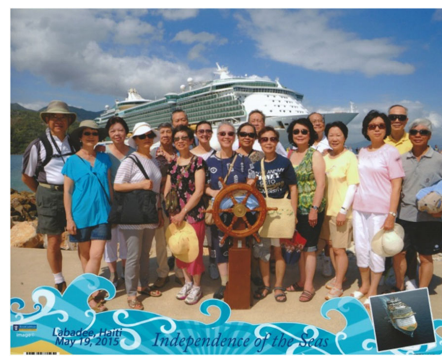
Greetings from the golden girls of the Class of 1965.