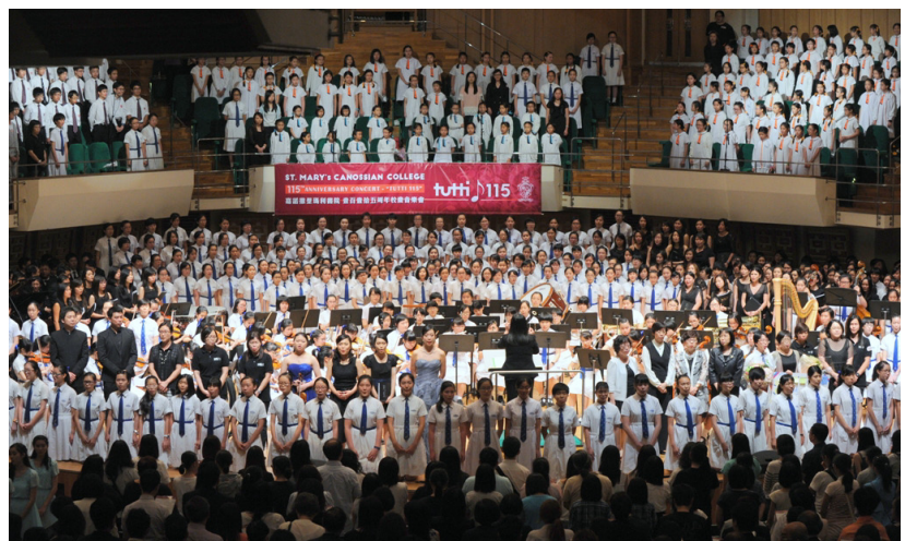
All performers gathered on stage for the School Song during grand finale.