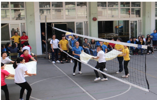
Having fun in group activities.