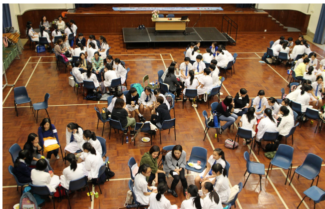
Getting to know each other in group discussions.