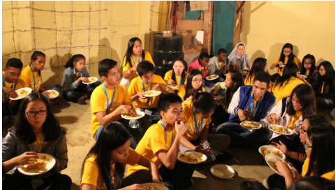
Group activities to experience poverty.

The Canossian Global Youth Conference 2015 (CGYC 15) was successfully held during 20-24 July this year. Jointly organised by a team of St. Marians and Sacred Heartists who are interested in humanity and international relations, it is a leadership training programme featuring cultural exchanges, experiential learning and presentations, while fostering the Canossian spirit of charity and humility.