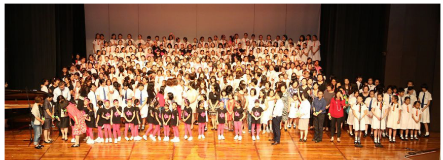
Guests and performers on stage at the grand finale.