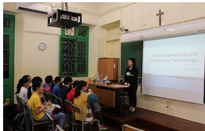
Sharing from mentors in careers seminars.