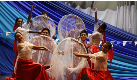
Enchanting performances on Cultural Night.

More than 88 Canossian youths from Canossian institutes in East Timor, the Philippines, Malawi, Malaysia, Italy, India, Macau and Hong Kong participated in the conference. The theme was “Poverty”, a theme specifically chosen by the organizers to raise the awareness of young Canossians towards this prevailing global issue, inspiring them to make effort to ease the situation with the Canossian spirit.