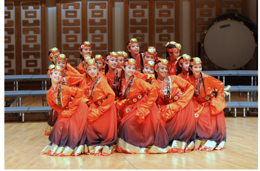
The St. Mary's Canossian College Dance Team.