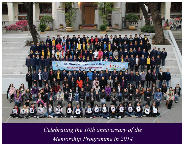
Celebrating the 10th anniversary of the Mentorship Programme in 2014

"The Principal has been devotedly steering the development of the school since she took office in 2007. She suitably delegates responsibilities and leads the teaching staff to set their focus on, and channel their effort into, serving the common good of the school. Being personable and open-minded, she is nonetheless steadfast in upholding the school's values and driving its pursuit of excellence, regularly communicating her expectations to the teachers and inspiring them to maintain high standards of performance.