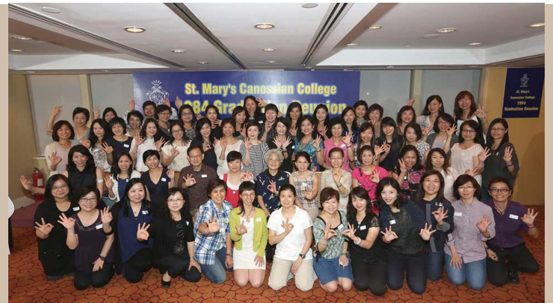
St. Mary's Canossian College 1984 Graduation Reunion(5th July 2014)