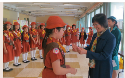
1. Delivery of badges to all student leaders after the School Opening Liturgy. 2. With the Brownies after their enrollment.