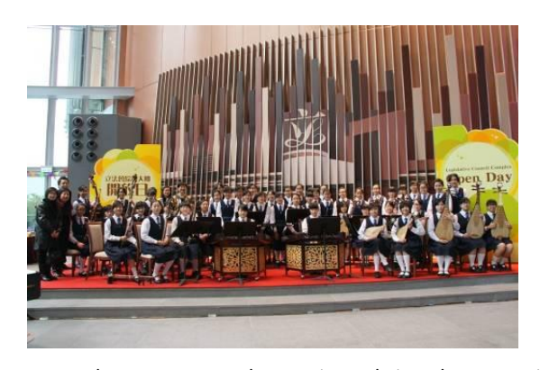
Chinese Orchestra at Legislative Council Complex Open Day

We also make an effort to provide more diversified programmes. Two important areas which we have picked up are Dance and Fashion Shows. Those of you who have had the chance to watch the Dance team perform would certainly marvel at their attractive, elegant moves and coordination. As for the Fashion Show, we have made it a yearly occurrence for Visual Art students to apply what they have learnt. Adjudicators and teachers have always been pleased with their high standard!