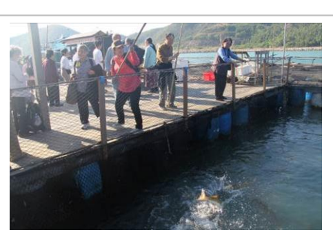
I've got it! I've got it!! Oh...missed again!!