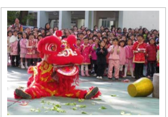
Pupils were amazed by the traditional lion dance performance during the Chinese New Year Cultural Day celebration.

In a similar way, we organized the Chinese Cultural Day activities to celebrate the Chinese New Year. Pupils were allowed to dress in their traditional New Year outfits on that day. I gave each