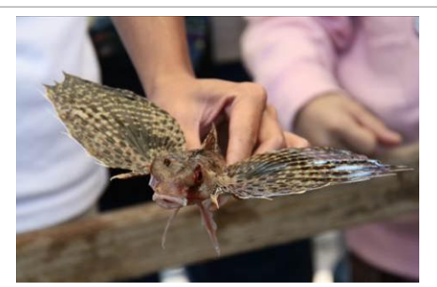
Have you ever seen a fish with wings?

It was a beautiful morning and the group gathered at the pier in front of the Cultural Centre in Tsimshatsui at 11 a.m. to board the ferry to Sok Kwu Wan, Lamma Island. After a fabulous seafood lunch at Rainbow Seafood Restaurant, the