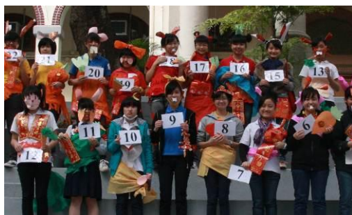
Teams dressed up their member as rabbits to compete in CNY Mascot Design competition.

Another new development this year is that a second meeting was scheduled on 26 February 2011 for organised activities, thereby creating one additional opportunity for mentors and mentees to meet. The 25 groups participated in team activities that allowed them to discover new things about their friends, and a mascot design competition to unleash their creativity. Throughout the year, informal meetings would also take place between mentors and mentees.