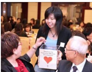
Donations were collected during dinner for Canossian Missions Development.