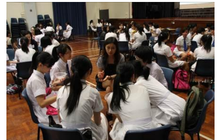
Mentors and mentees meeting in small groups.

mentors to take care of 142 students this year. Mentors in pairs were matched with groups of 5-6 mentees, forming 25 groups. The first meeting took place on 23 October 2010.