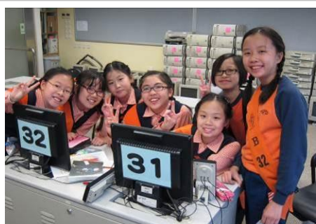
The new generation of students are familiar with computers from a young age.

Every time when our past students come back to visit, they will discover something different, either regarding the teaching staff or the school's physical environment. In the past decade, quite a number of experienced teachers had retired. You must have missed some of your beloved teachers when you discovered that they were no longer teaching in St. Mary's. You will also see changes in the learning environment and school policies. For instance, you used to study a subject called Health Education. From it, you acquired knowledge about good habits in hygiene, sports, diseases, body structure, etc. The subject is now cancelled, but several topics are merged into General Studies. At the same time, health issues have been given priority and regarded as part of our policies. Each pupil's diet and physical fitness are areas of our concern. Every morning we make sure that pupils have taken and recorded their body temperature properly before they come to school. They have to wash their hands right after their arrival and before lunch. As a result, you will find posters in the corridors reminding pupils to wash their hands.