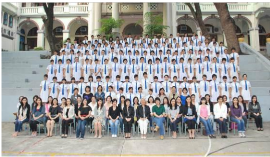
Mentors and mentees posed for a group photo after their first gathering.

The Mentorship Programme 2010-11 continues to evolve. This year, the school has changed to the NSS curriculum and thus students from both F.5 and F.6 were eligible to join the programme. As there were too many eligible students, we adopted a voluntary approach for mentees to participate in the programme. We also encouraged mentors to join in pairs, so that they can support each other. In the end, we successfully invited a total of 51