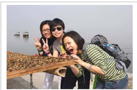
It's time for lunch, and some of us just couldn't wait to taste the oysters!

The programme started at 10 am when we departed from campus for Lau Fau Shan by coach. After a 40-minute journey, the group arrived at Lau Fau Shan's main street and immediately began their "treasure hunt" in the alleys - dried scallops, handmade cookies, Hak Ka style sweet mochi and other