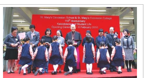
Our primary students delighted our honourable guests with their curtsies after the souvenir presentation.

All too soon, the Thanksgiving Mass and Open Day in celebration of our 110^{th} anniversary are over! This joint venture between SMCS and SMCC was in fact an extension of our collaboration in our "through-train" endeavour. The result has been a delightful, heart-warming and unprecedented event which one school alone could never have achieved.