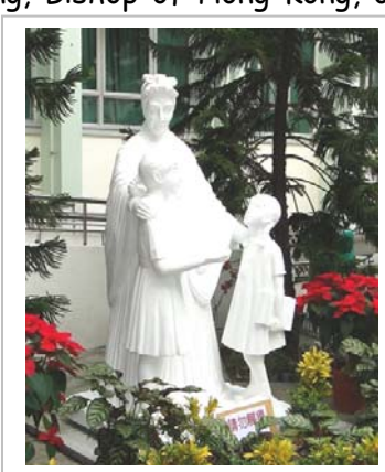
The statue features our Foundress with students from both SMCS and SMCC.