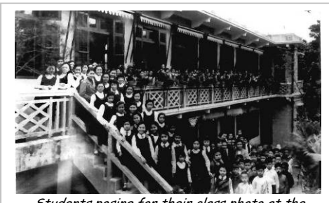
Students posing for their class photo at the St. Michael Building in 1930.

The St. Michael Building & the Main Building of St. Mary's have been included in the list of Grade II Historic Buildings in Hong Kong (i.e. buildings of special merit, and efforts should be made to preserve them selectively.) Only 4 secondary schools are on the list. The other 3 are King's College, King George V School & St. Stephen's College, Stanley. Another 8 schools are on the Grade III list.