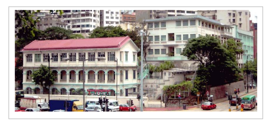
The St. Michael Building and the Main Building, sheltering the school campus from the hustle and bustle of Tsimshatsui, and nurturing generations of St. Marians through the years.

• Before 1953, the chapel was located on the 1<sup>st</sup> floor of the Main Building, and the current chapel was the School's gymnasium. The gym was moved to the current location when the School Hall complex was completed in 1953. The chapel was then relocated to the present site, and has provided shelter for the mind and soul of thousands of St. Marians ever since.