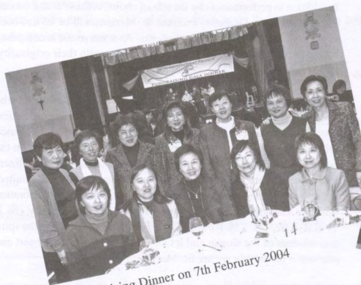
The Fundraising Dinner on 7th February 2004